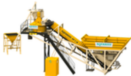
STATIONARY BATCHING PLANT