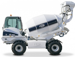
SELF LOADING MIXER REAR LOADING