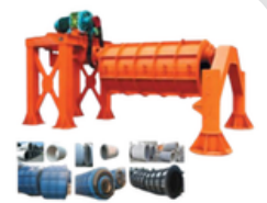
PIPE MAKING PLANT

soilmeco Drilling and Foundation Equipment