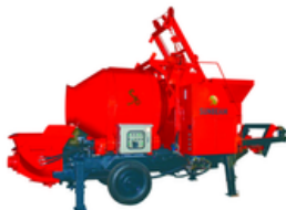
MIXER WITH PUMP