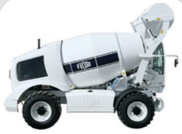
SELF LOADING MIXER FRONT LOADING