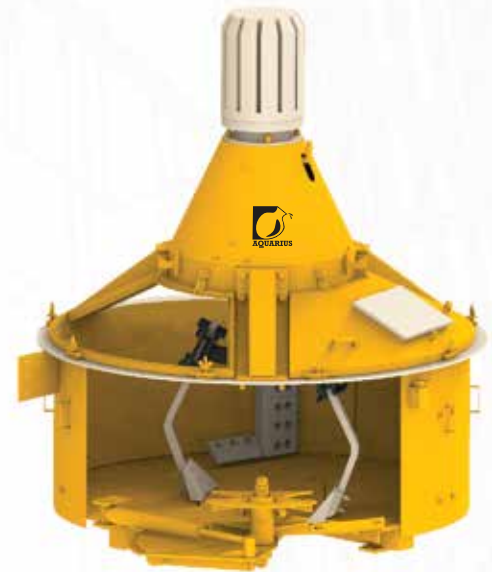
AQUARIUS Planetary Mixer