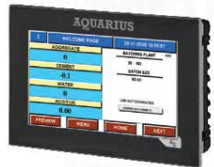
HMI control AQ-TOUCH II

Performance of equipment is based on standard working conditions. Design / Specifications can be changed without prior notice.