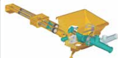
Worldwide Preferred 'S' Valve Technology